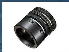
PACKRYT BEARING SYSTEMS

Commercient Integrates Made2Manage and Salesforce Enterprise